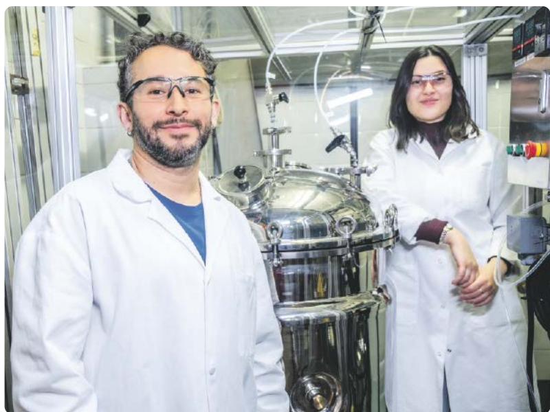
Porelio's pilot plant enables scalable, continuous synthesis of functionalized ordered mesoporous silica (FOMS), optimizing adsorption performance for industrial applications.