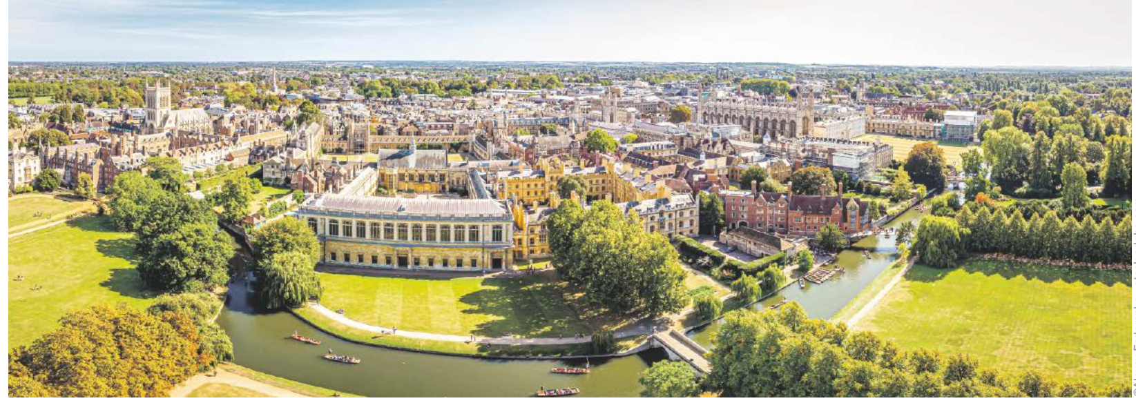
Cambridge is part of the ,Golden Triangle'. The region belongs to the top 25 clusters in the world.