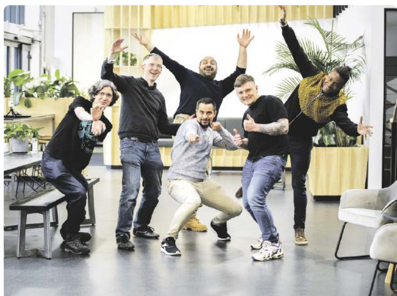
Reach Industries is an early-stage start-up with a mission to augment scientists and make labs more efficient, so they can better and faster tackle world challenges.