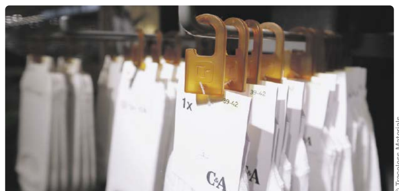
Traceless provides a natural and biocircular alternative to conventional plastics.