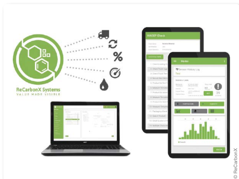
A digital twin of production processes is created with IoT sensors, ERP and manual inputs.