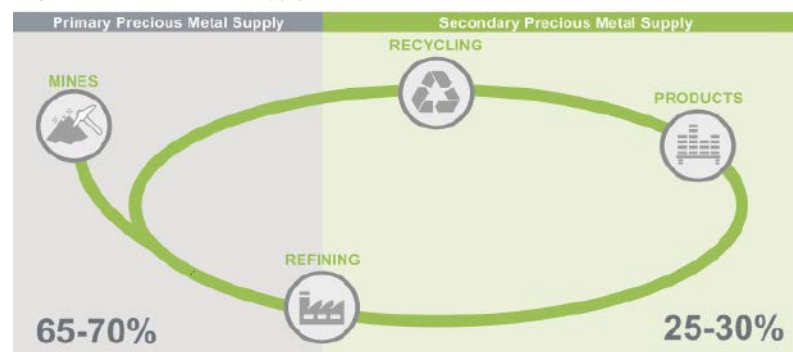
Physical Precious Metal Supply Chain

mining, extraction and concentration. The other factor that further increases the carbon footprint is energy mix in South Africa, the major producing country of PGMs. Nearly 90% power used for producing comes from hard coal. The following refining of the precious metal concentrates only adds a minor part to the overall carbon footprint.